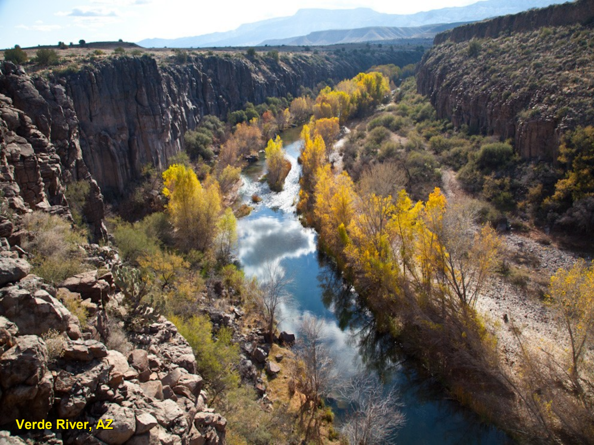
Verde River, AZ