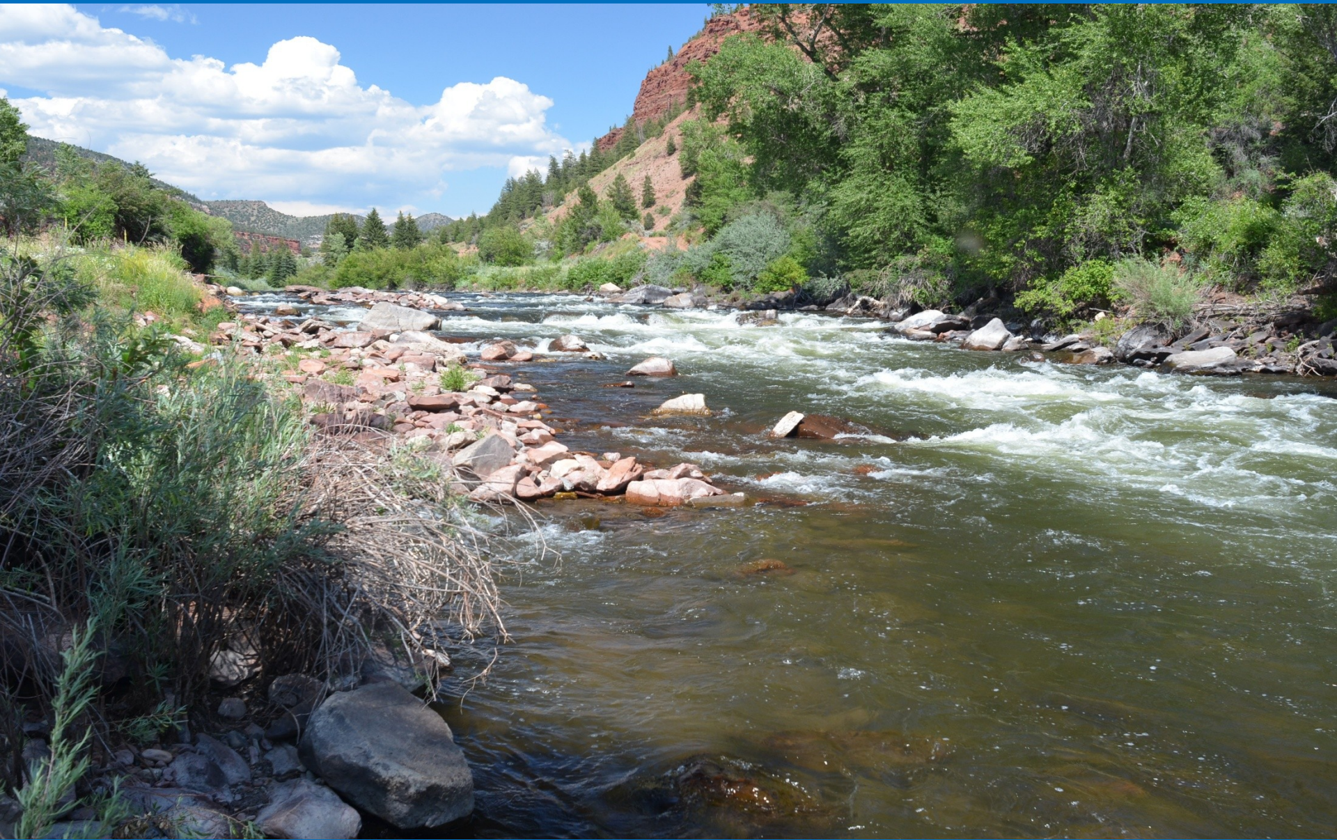
Eagle River, CO